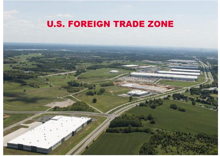
U.S. FOREIGN TRADE ZONE