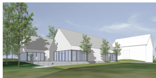
Left: The Board tours the property last June. Top: What the new building might look like.

The Farm Foundation Innovation and Education Campus (IEC) has officially launched with the purchase of a historic farm in Libertyville, Illinois.