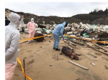
The dead ASF infected pig as it was discovered on the shores of Kinmen Island. The photo was made available by the Taiwanese coast guard. Photo: Taiwan Coast Guard/ EPA/ ANP

Sows Piglets Finishers Health African Swine Fever World of Pigs Kinmen Island is located only a few km out of the coast of China and the city of Xiamen. Although it is only a short ferry ride away from the mainland, geographically, Kinmen Island is part of Taiwan. Quite regularly, trash from the mainland washes ashore and on December 31, a dead pig was found between the debris.